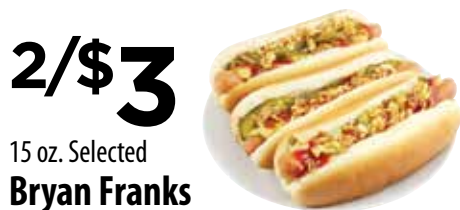
2/$3 15 oz. Selected Bryan Franks

8 ct. Shurfine Hot Dog Buns 99¢ 10 oz. Selected Austex Hot Dog Sauce 69¢