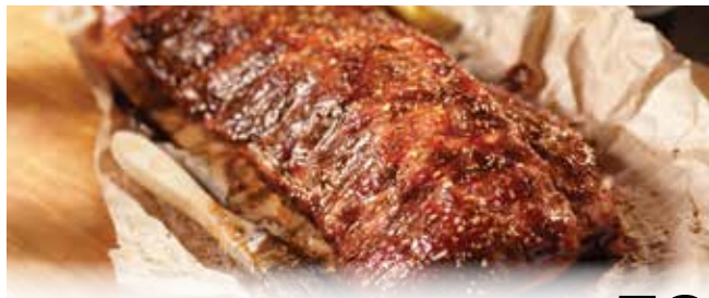
Lean & Meaty! Pork Baby Back Ribs 2 59 lb.