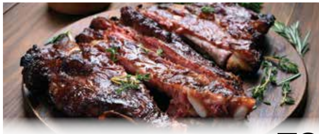
Family Pack! BBQ Pork Strips or Steaks 1 79 lb.