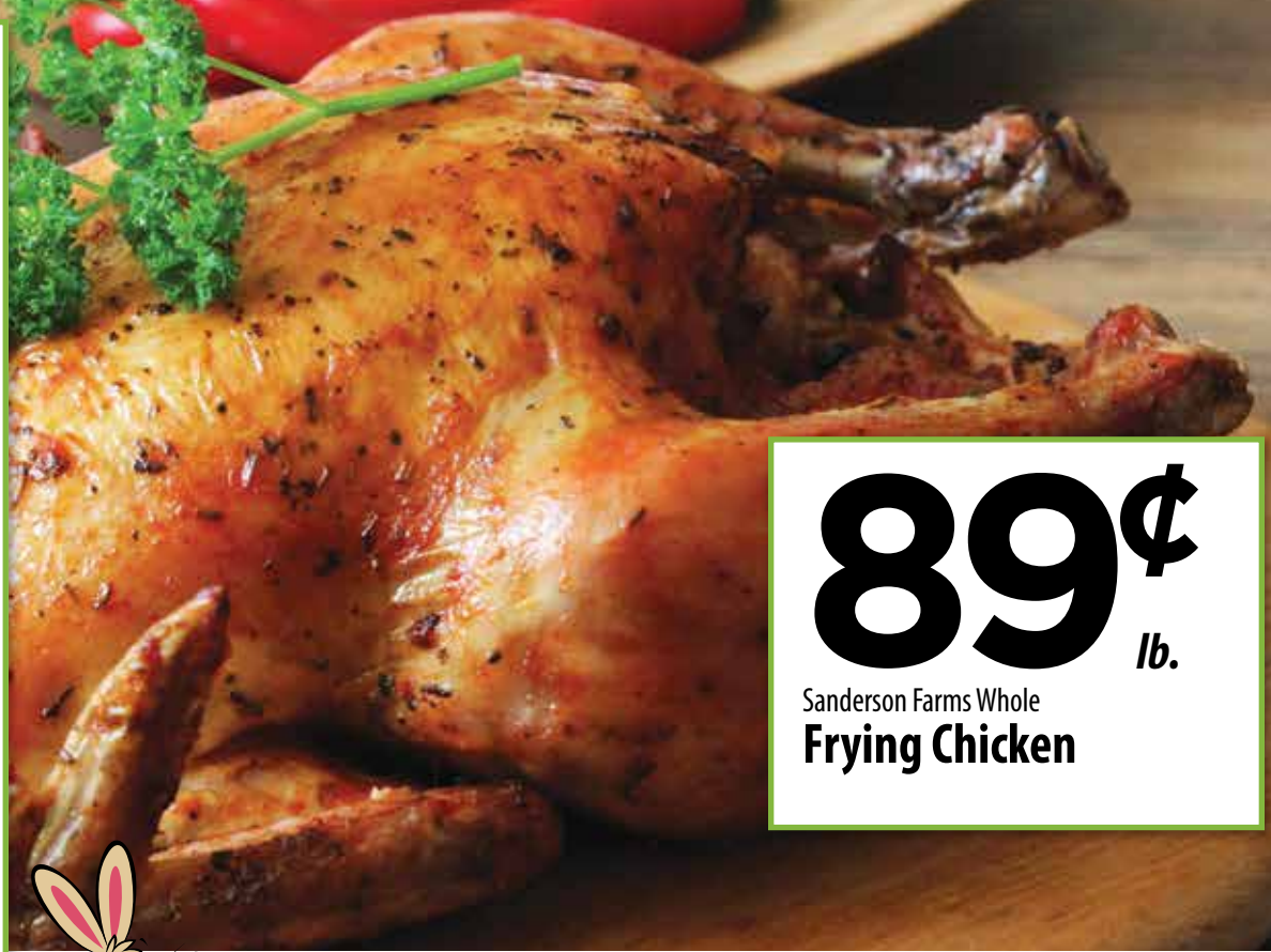
89¢ lb. Sanderson Farms Whole Frying Chicken

8 ct. Shurfine Hot Dog Buns 99¢ 10 oz. Selected Austex Hot Dog Sauce 69¢