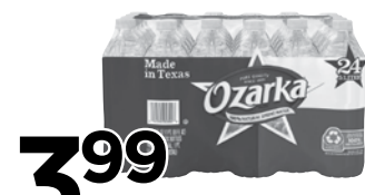
3 99 24 pk. .5 ltr. Bottles Ozarka Spring Water