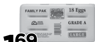
1 69 18 ct. Sunups Large Eggs