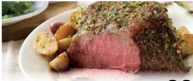
USDA Trimmed Boneless Rump Roast 2 99 lb.