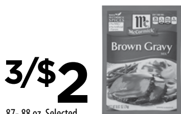
3/$2 .87-.88 oz. Selected McCormick Brown Gravy Mix