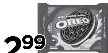
2 99 7.9-16.6 oz. Selected Nabisco Oreo Cookies